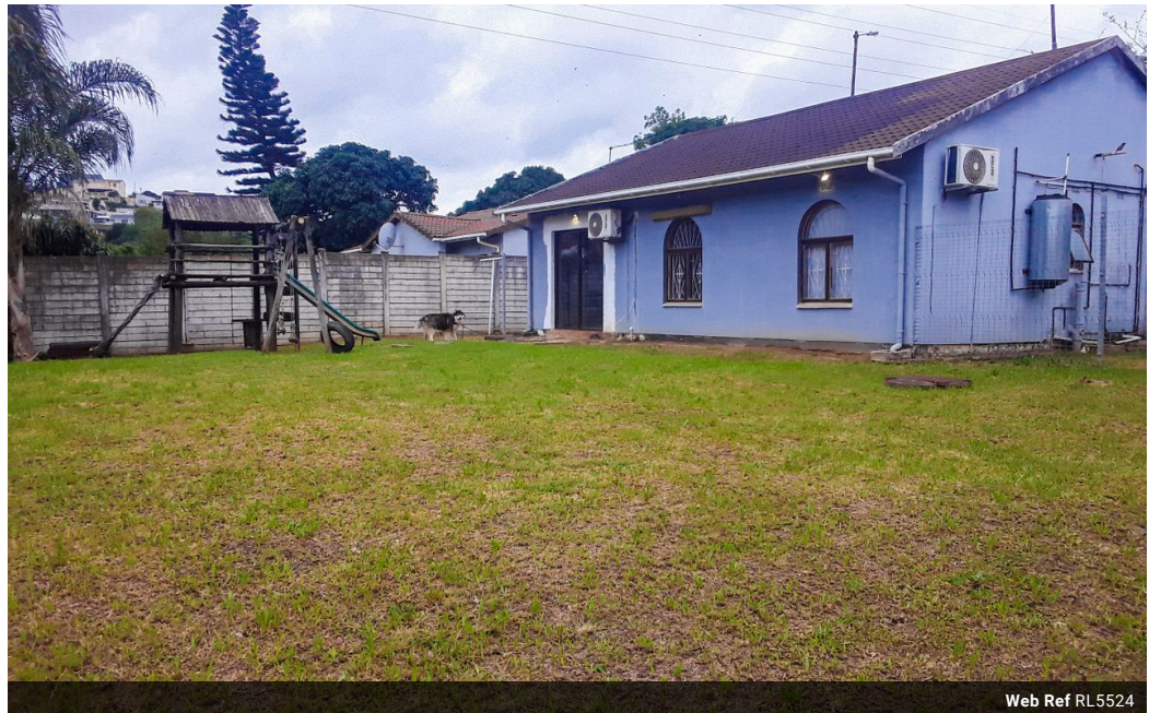
Web Ref RL5524

Ridge 6 20 Ncondo Place Umhlanga Ridge Umhlanga