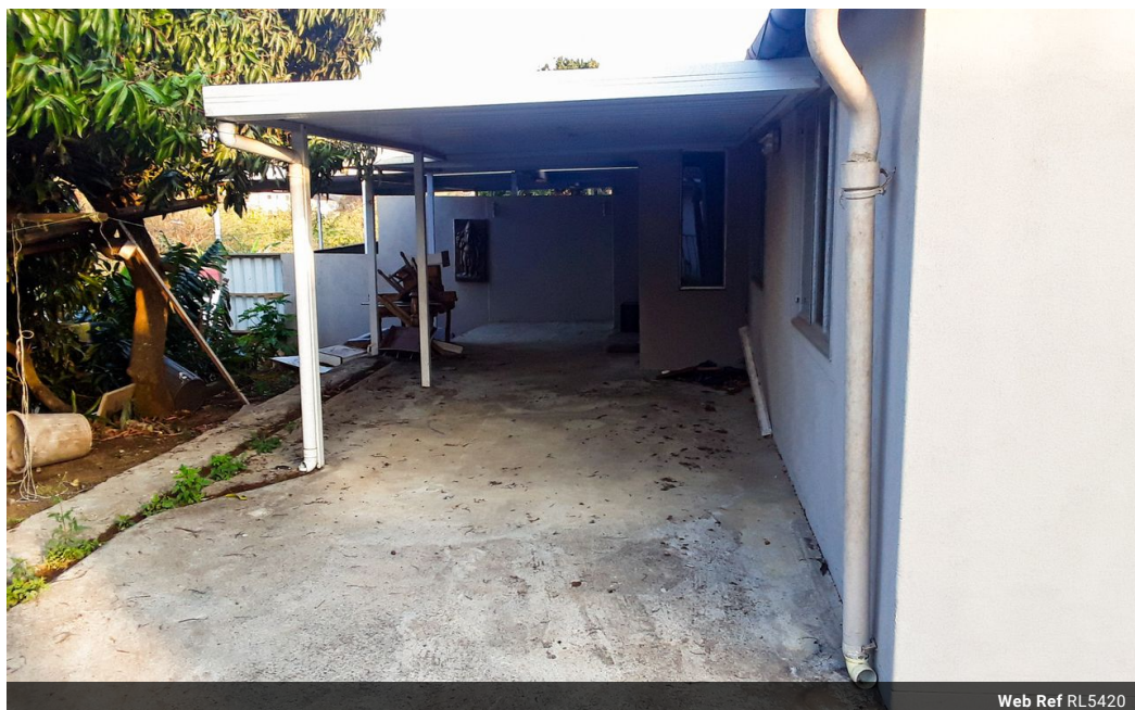
Web Ref RL5420

Ridge 6 20 Ncondo Place Umhlanga Ridge Umhlanga