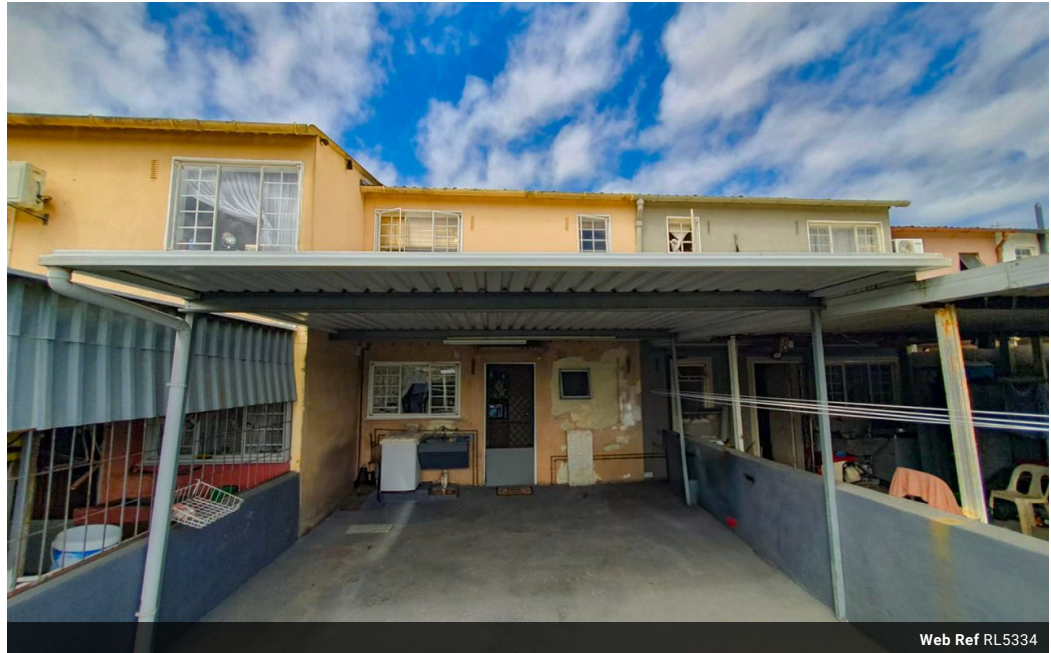
Web Ref RL5334

Ridge 6 20 Ncondo Place Umhlanga Ridge Umhlanga