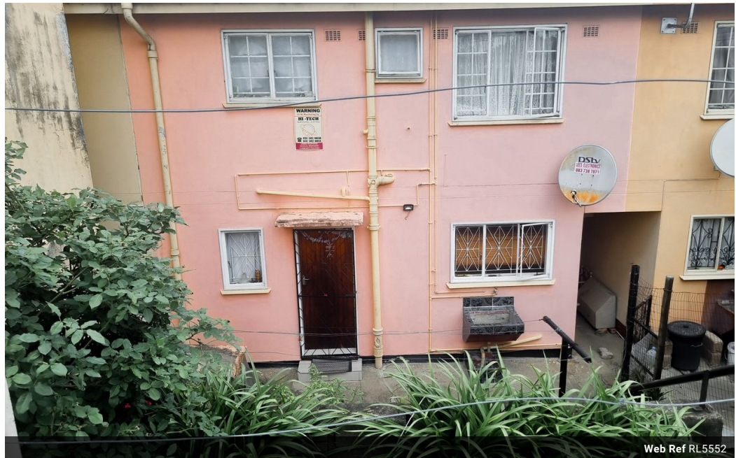
Web Ref RL5552

Ridge 6 20 Ncondo Place Umhlanga Ridge Umhlanga