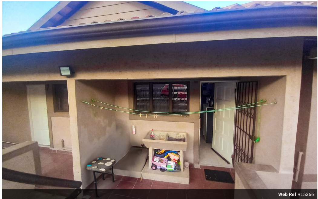
Web Ref RL5366

Ridge 6 20 Ncondo Place Umhlanga Ridge Umhlanga