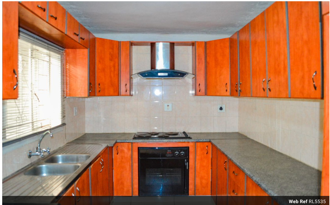
Web Ref RL5535

Ridge 6 20 Ncondo Place Umhlanga Ridge Umhlanga