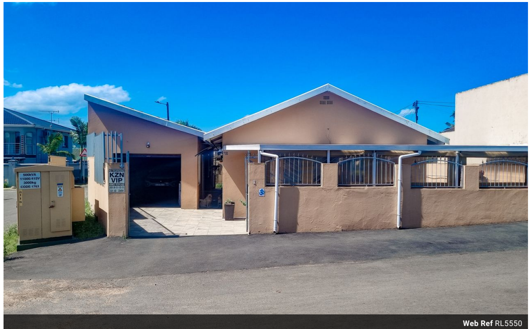
Web Ref RL5550

Ridge 6 20 Ncondo Place Umhlanga Ridge Umhlanga