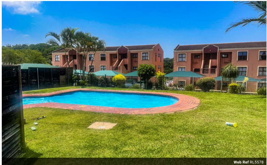
Web Ref RL5578