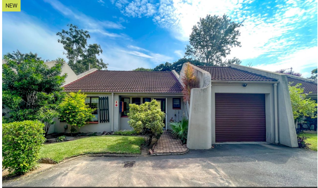
SOLE MANDATE Web Ref RL5666