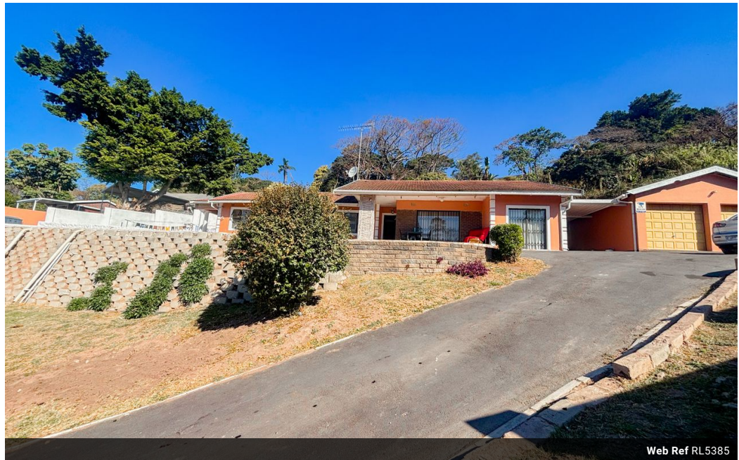
Web Ref RL5385