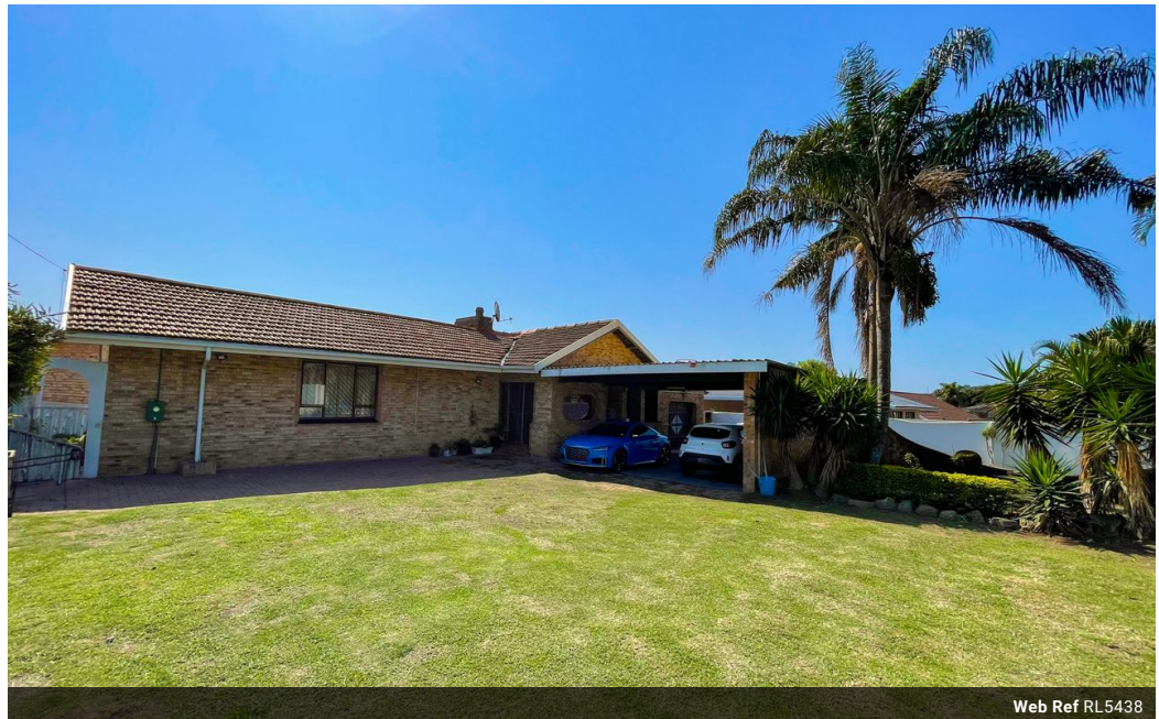
Web Ref RL5438