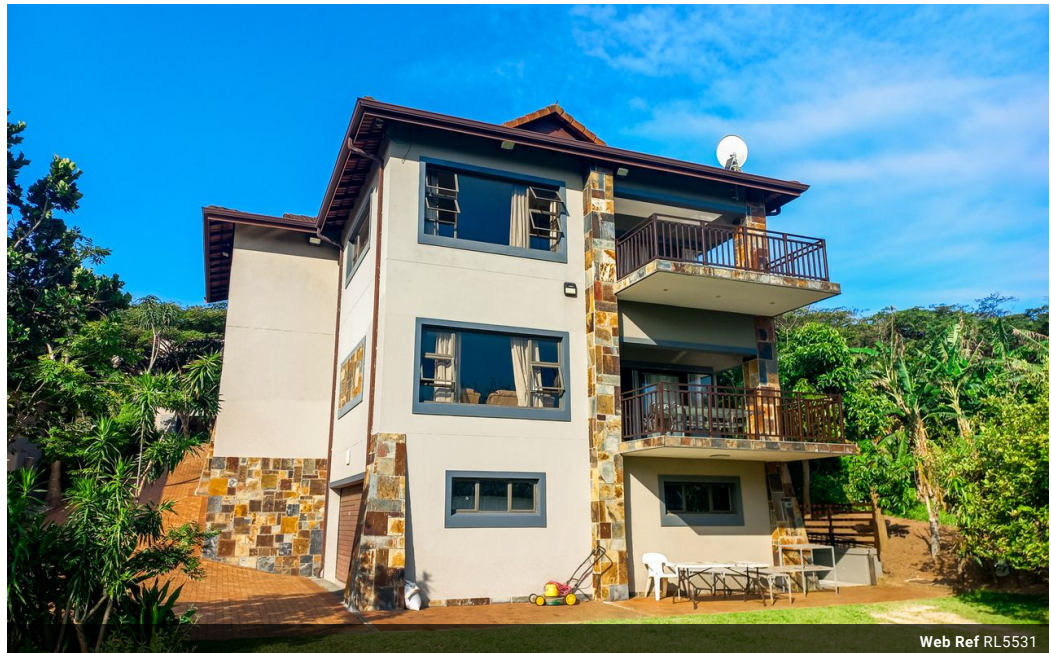
Web Ref RL5531

Ridge 6 20 Ncondo Place Umhlanga Ridge Umhlanga