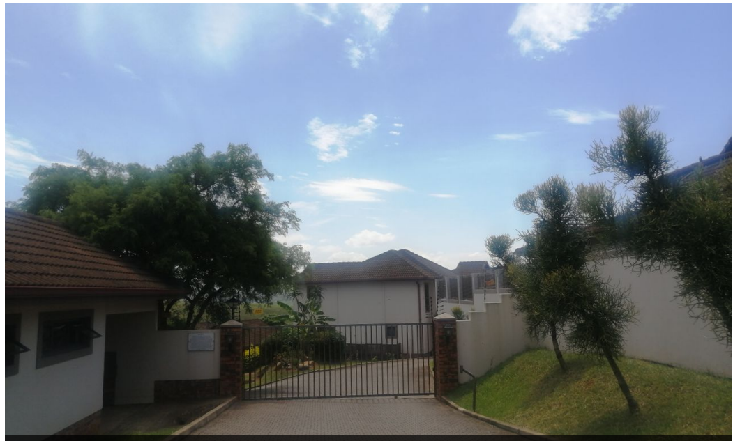
ON SHOW, SOLE MANDATE

ON SHOW BY APPOINTMENT OFF WAGER AVENUE TO ILANGA CLOSE