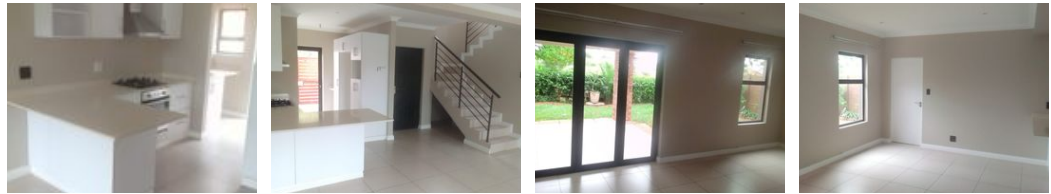
Web Ref RL5651