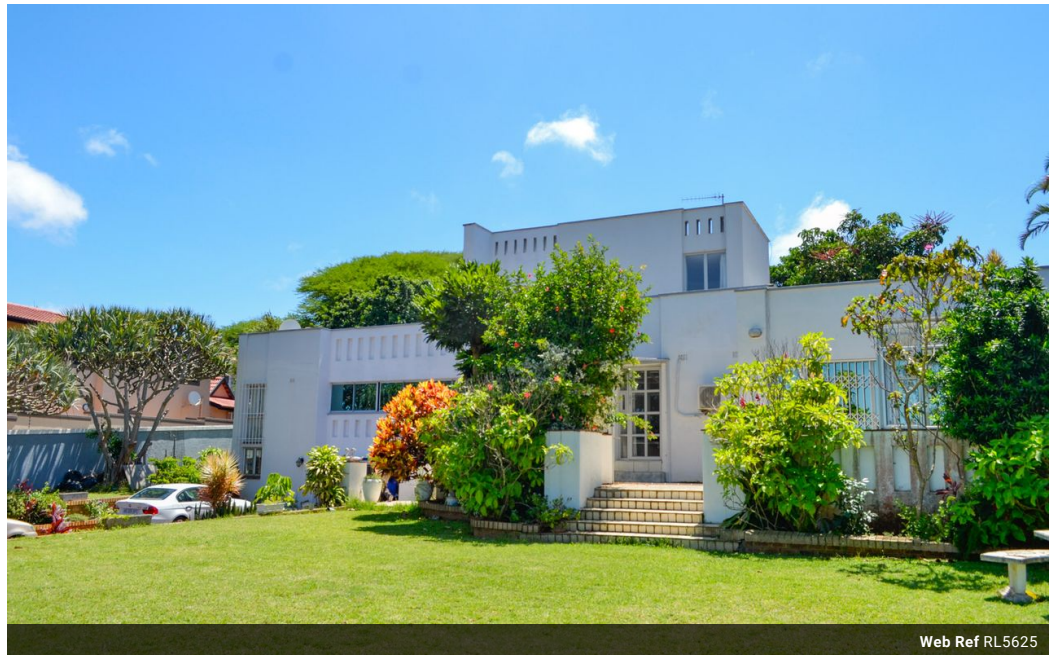
Web Ref RL5625

Ridge 6 20 Ncondo Place Umhlanga Ridge Umhlanga