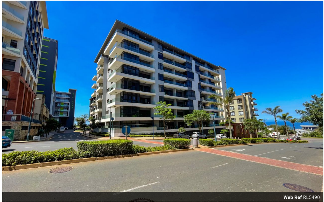
Web Ref RL5490

Ridge 6 20 Ncondo Place Umhlanga Ridge Umhlanga