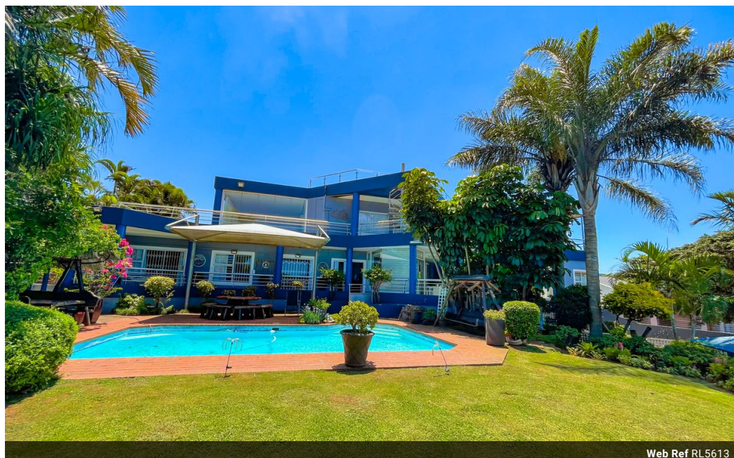
Web Ref RL5613

Ridge 6 20 Ncondo Place Umhlanga Ridge Umhlanga