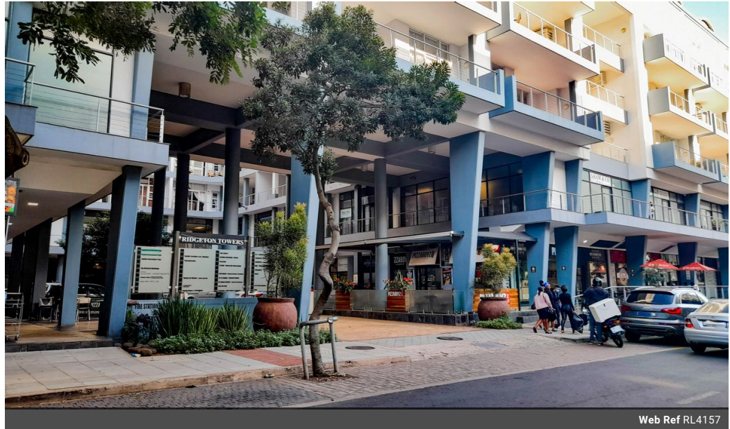
Web Ref RL4157

Ridge 6 20 Ncondo Place Umhlanga Ridge Umhlanga