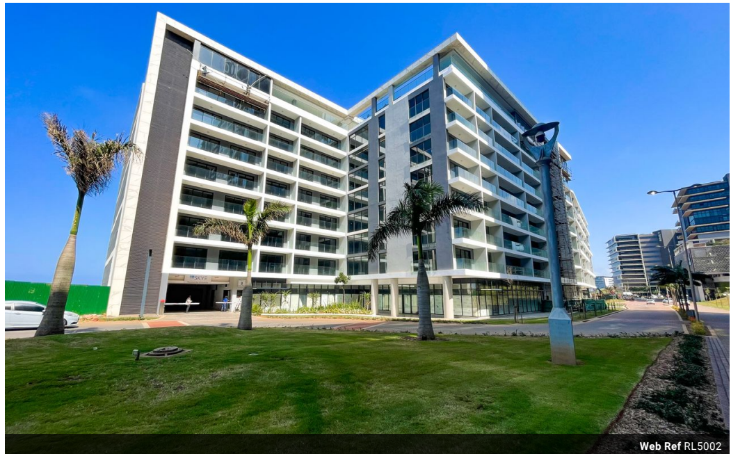
Web Ref RL5002

Ridge 6 20 Ncondo Place Umhlanga Ridge Umhlanga