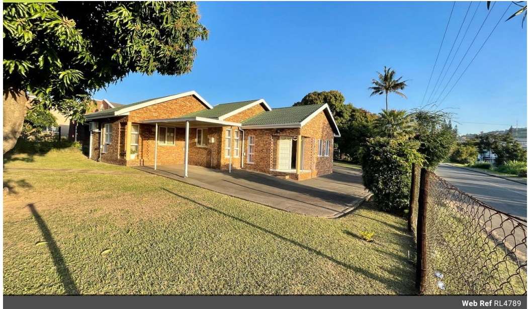
Web Ref RL4789