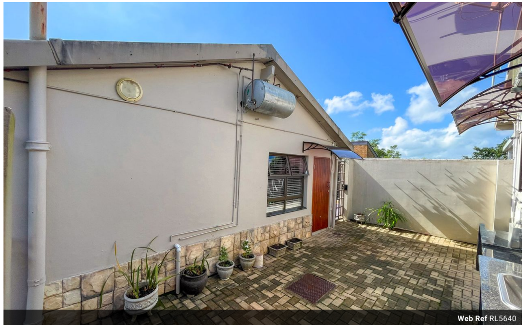
Web Ref RL5640